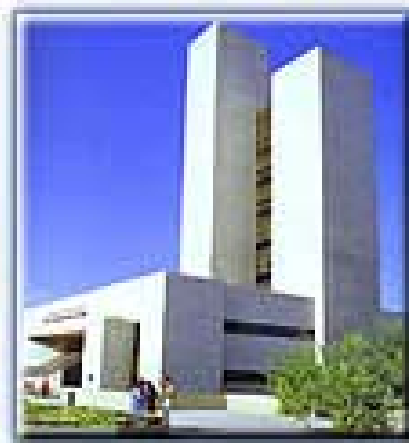
Biblioteca Fray Servando Teresa de Mier