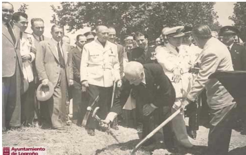
Picture 2 – Indexing Associated to a Photograph Described Following the ISAG(g) in the Municipal Archive of Logroño.

subsequent recover of documents through the Internet, as it is the case of the Archivo Municipal de Arganda del Rey (Madrid) the one of the File del Reino de Valencia (Valencia).