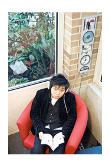
programming for teens??