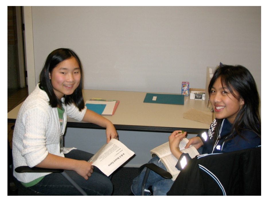
Hanging out when the little kids don't show up