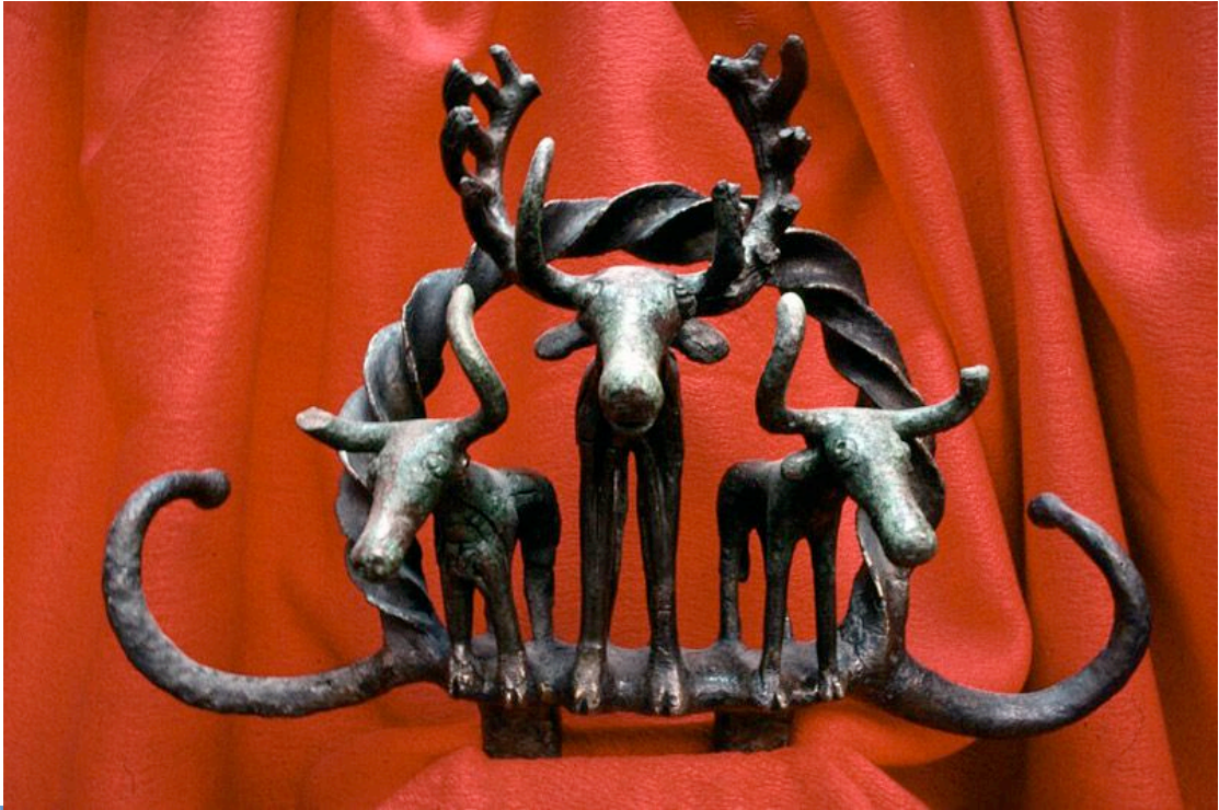
Figure 3. Ceremonial standard

Fortunately, there is a modern sculpture, the Hatti Monument (also in Ankara) which is immediately accessible and un-missable. It is a massive city monument. Surely anyone who sees it in Ankara will ask why is that there? What does it mean? Where does it come from?