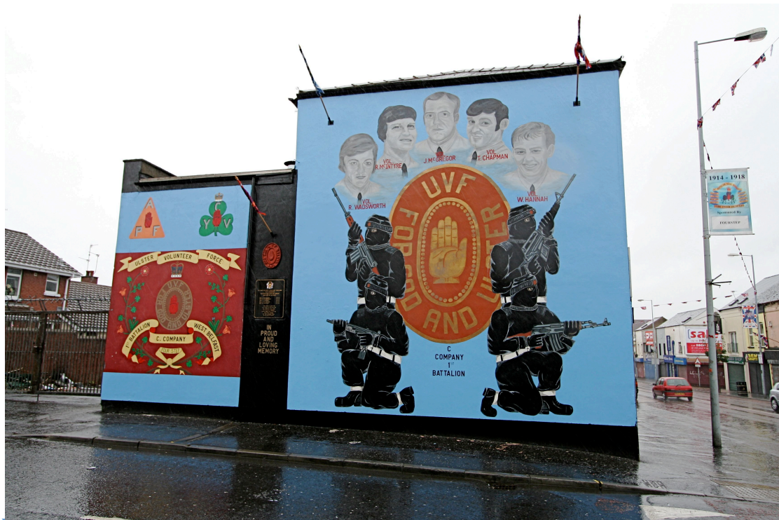
Figure 6. Belfast mural: UVF Loyalists

Fortunately, many of the murals have been photographed and archived in digital format before being “lost forever” as murals