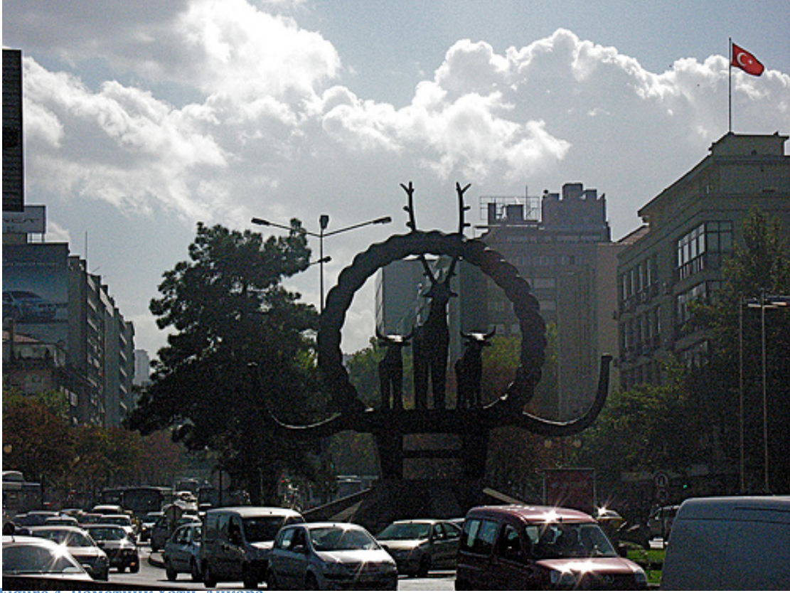
Figure 4. Памятник Хати, Анкара

Backstory: „İki yıl önce, 2007 yılı sonbaharında, Ankara’da Bölümümüz tarafından gerçekleştirilen başarılı bir sempozyumun ardından Kapadokya’ya “güzel atlar ülkesine” bir gezi düzenlendi. Arkadaşlarımla birlikte ben de bu gezideydim. Sabahın erken saatlerinde başlayan otobüs yolculuğumuz yaklaşık 5 saat sürdü. Kapadokya; güzelliğini anlatmak için kelimelerin yetersiz kaldığı, doğa harikası muhteşem bir yer... Kapadokya’ya daha önceleri de birçok defa gitmiştim fakat bu durum tekrar orda olmanın heyecanını azaltmıyordu. Uçhisar Kalesine çıktığınızda peri bacalarının muhteşem manzarası karşısında müthiş bir sonsuzluk ve özgürlük duygusu... Fakat yerin altında 8 kattan oluşan Derinkuyu yeraltı şehrinde ruhunuzun daraldığını, nefes alamadığınızı hissediyorsunuz. Bir taraftan binlerce yıl önce insanların yerin metrelerce altında kurdukları düzeni, yaşama ve düşmandan korunma biçimlerini hayranlıkla izlerken, bir taraftan da yer üstüne çıktığınızda rahat bir nefes almanın ve gökyüzünü görebilmenin mutluluğunu yaşıyorsunuz. En kısa zamanda Kapadokya üzerinde balonla gezebilmenin hayalini kuruyorum.“