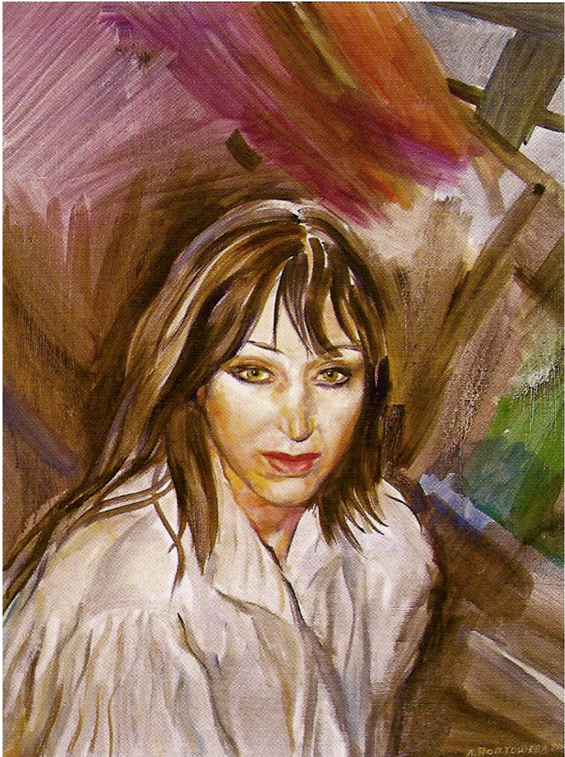
Figure 2. Memory — Self-portrait