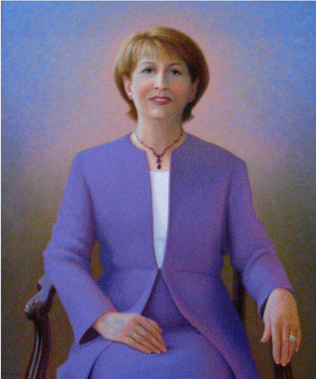
Figure 9. Mary McAleese, President of Ireland