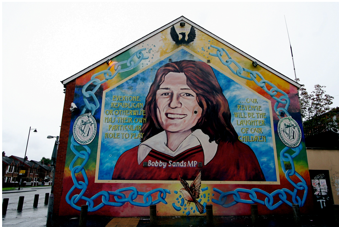
Figure 5. Belfast mural: Bobby Sands MP

There is a certain fragility to a painted mural, especially in a damp climate such as that of Northern Ireland. To persist it must be re-painted. Such murals are ephemeral by their very nature. In the context of Northern Ireland, each mural belonged to a distinct sort of “tribal area” and celebrated a particular event or person. In a sense, the mural served as territorial marker.