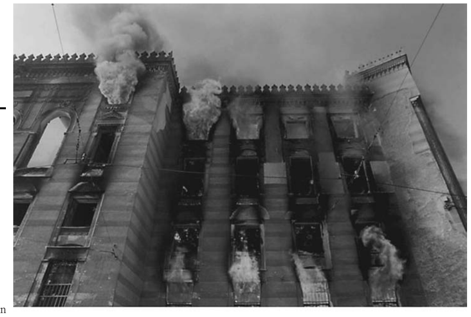
Figure 3. The National and University Library of Bosnia and Herzegovina in Sarajevo in 1992