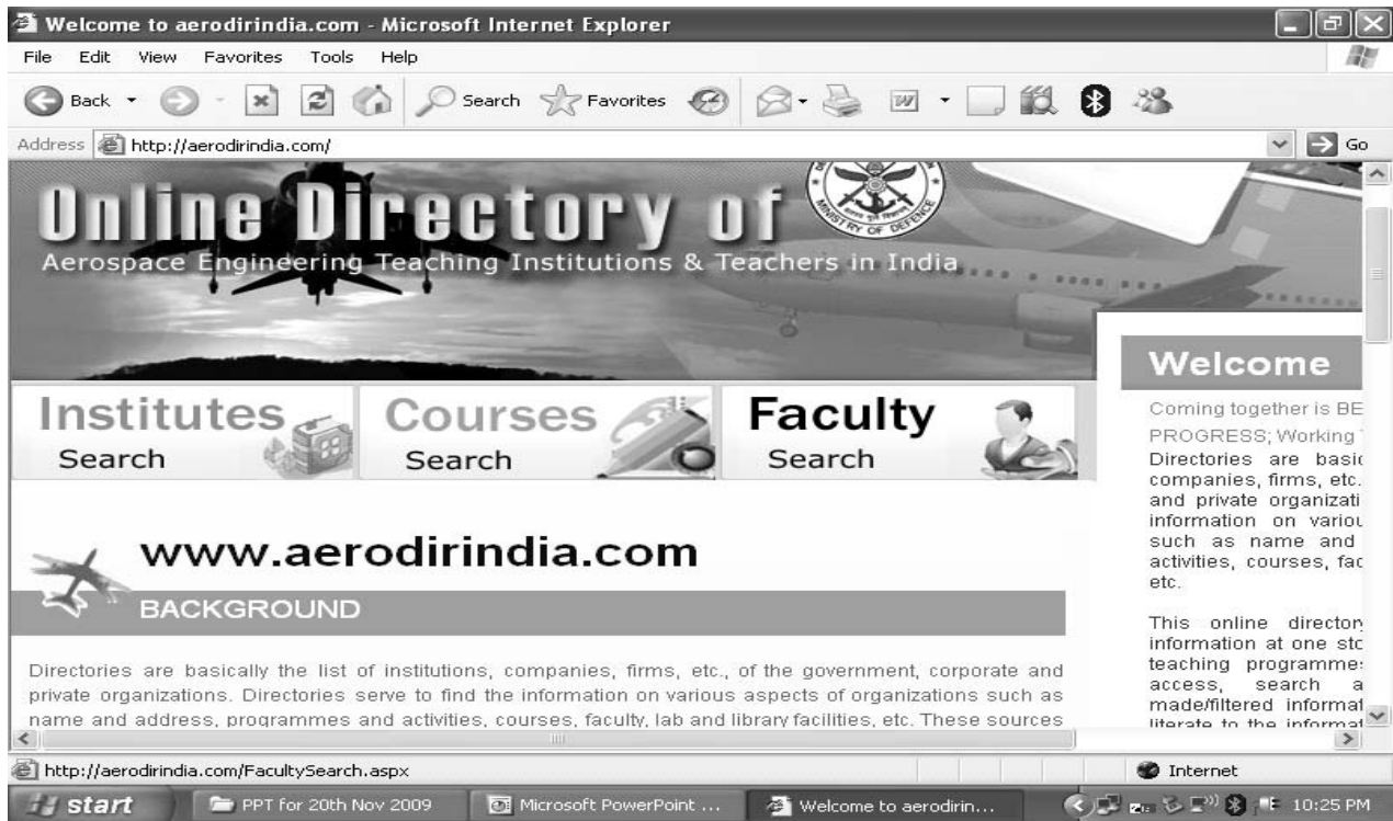
Figure 1. Screenshot of the directory.