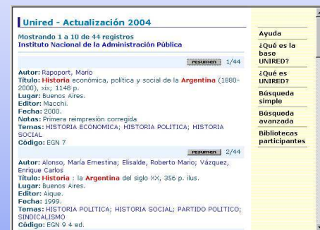
Example of searched record