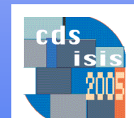
Bibliographic formats of participant libraries

II World Congress of CDS/ISIS Users Salvador - Bahia 20-23 september 2005