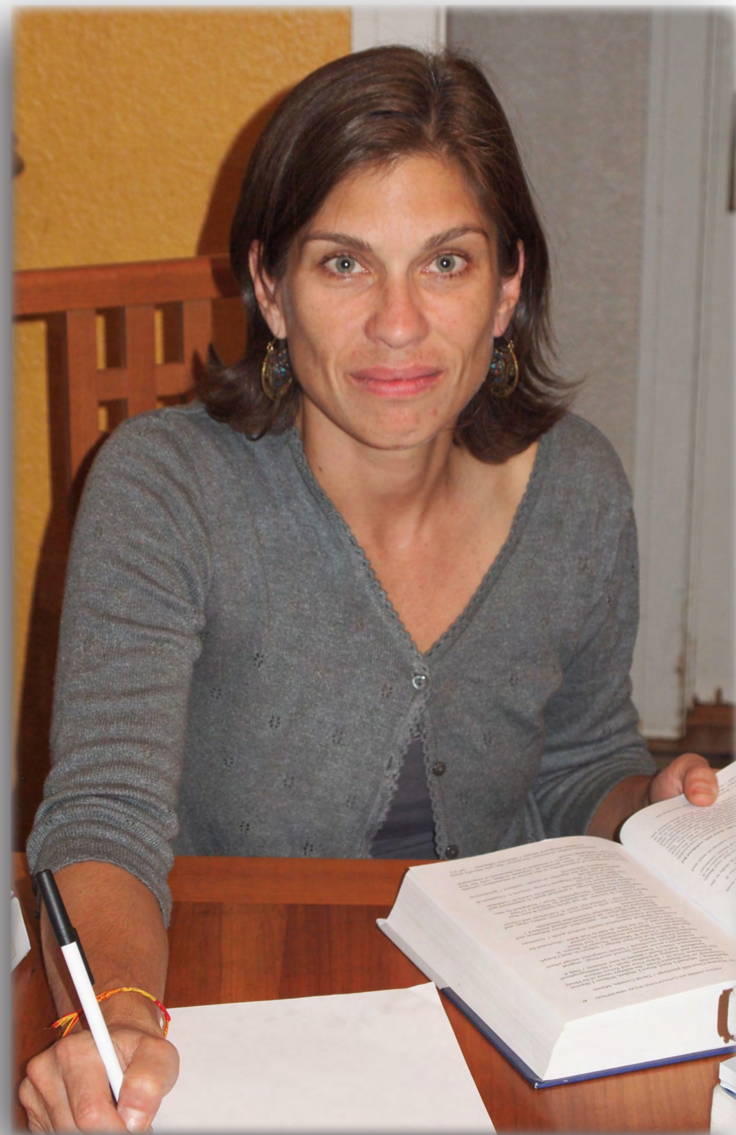
Researchers often work in isolation.