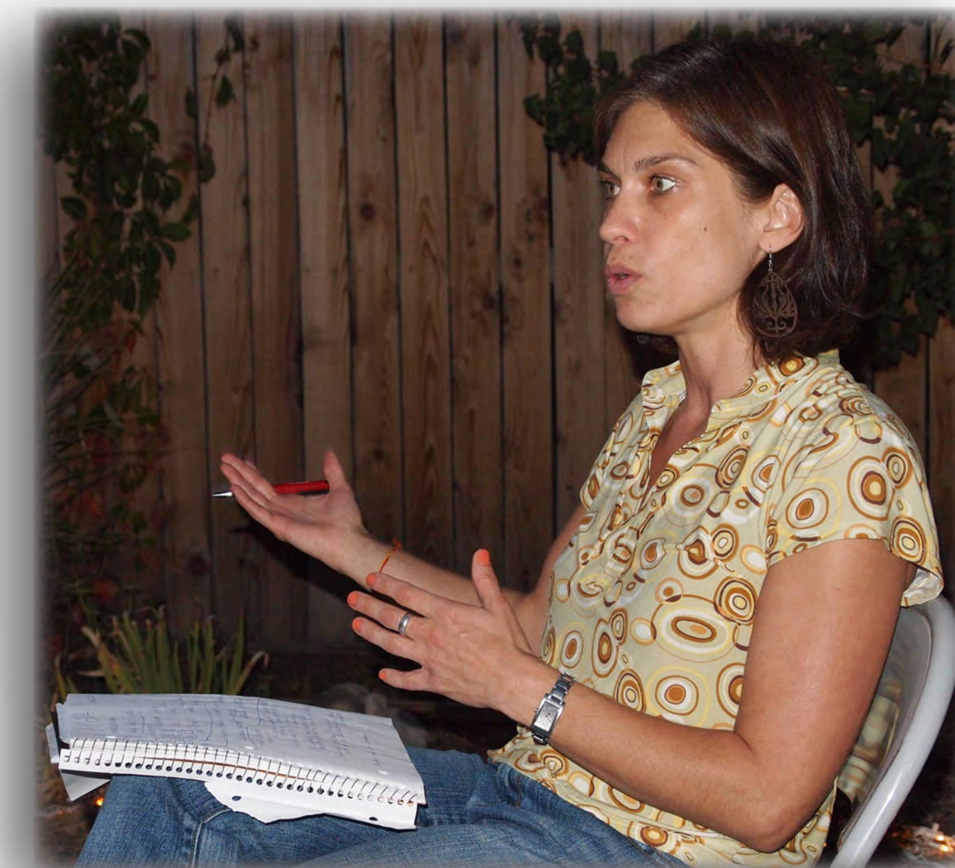
Student scholars benefit from the opportunity to present research in a collaborative setting.