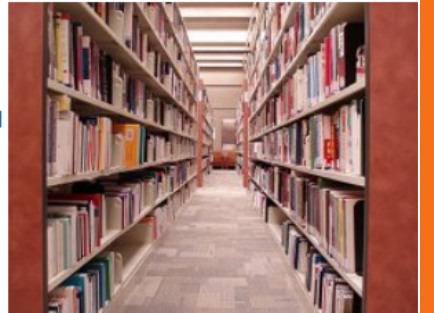
Library at York University