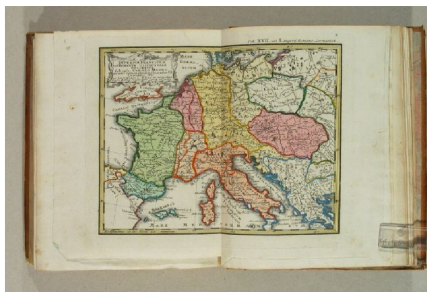
Old printing book in the digital laboratory

Performed by: librarians responsible for the respective collections.