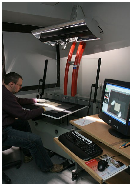
The Digital Laboratory, © Piotr Kurek

It is important to remember that some work processes are performed concurrently, whereas others consecutively. It should also be foreseen that some processes will be held up and will not be resumed without additional efforts or costs. Once the tasks are assigned, it is vital to properly supervise their completion; therefore, it is also crucial to define the scope of responsibilities of every staff member.