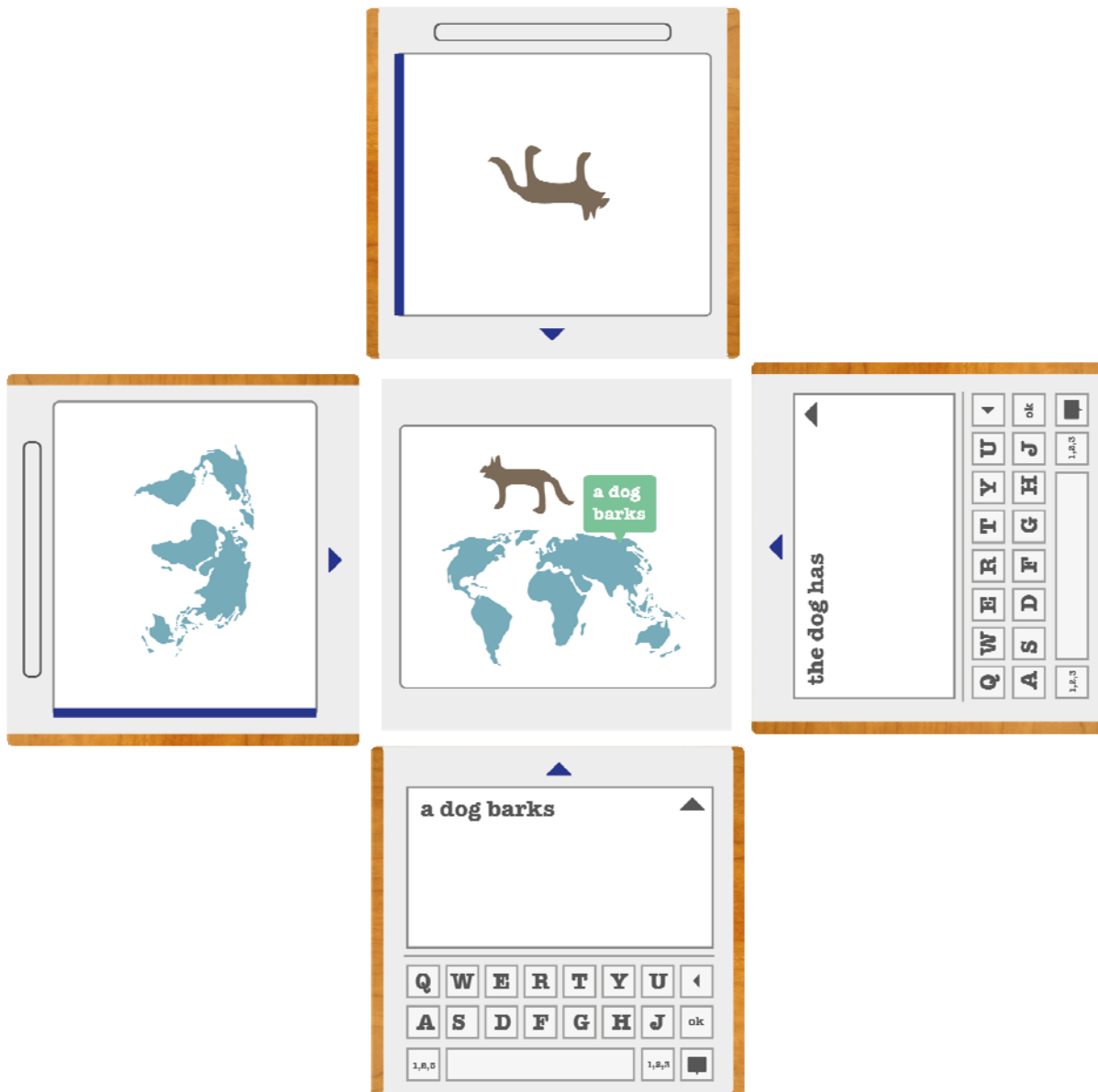
Figure 3: Visualization of the Square1 November 2012 prototype (by Anna Keune).

The hypothesis of the Square1 prototype has been that by introducing a set of computer devices that are built by children and precisely designed for SOLE purposes, children will reach a higher level of ownership of their learning, get a better understanding of the technology used in their everyday life, and get engaged to the SOLE kind of learning projects. The experience of building their own learning devices and by using them in learning where they are responsible for the results of learning is expected to have a long-lasting empowering effect on the children. The design of the Square1 prototype also carries the idea of slow technology. The slowness does not mean slowness of the software running in the device but rather being slow with some tasks when compared to the time needed to complete them with a pen and paper or a laptop computer. This approach is aligned with slow