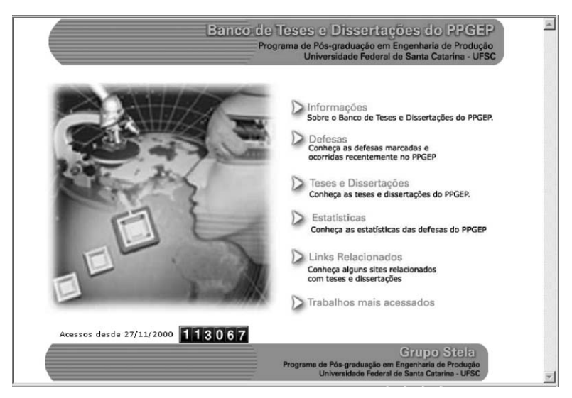
FIGURE 1. The BTD website (UFSC/PPGEP 2000).

2002). Fig. 1 shows the website interface. The next section describes the features of BTD that allowed for such expressive numbers.