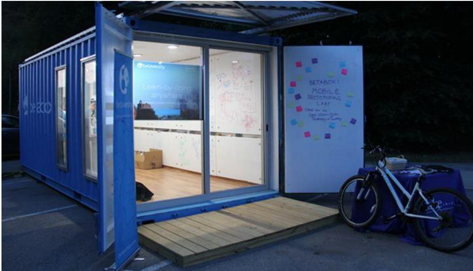
MOBILE PROTOTYPING LAB