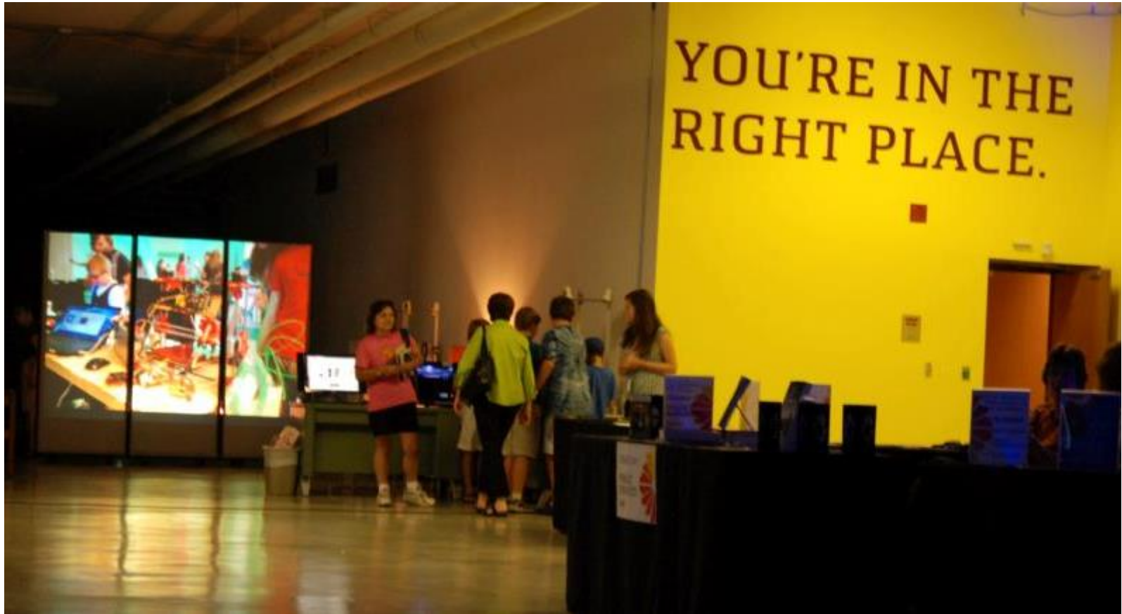
Chattanooga Public Library (4th Floor)