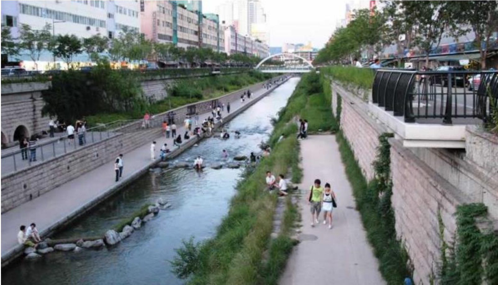
CHEONGGYECHEON RESTORATION PROJECT, SEOUL