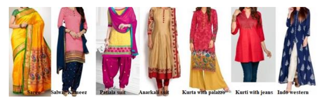
Figure no. 1: Indian women in various clothing style

Tattoos have been around in India since ancient times. The practice of tattooing as a cultural symbol is followed in many of the tribes in India as well as general Hindu population. Over the ages, the Indian body art has undergone a great transformation – from tattooing for beauty and tradition to tattooing for fashion and beliefs (Pal, 2016).