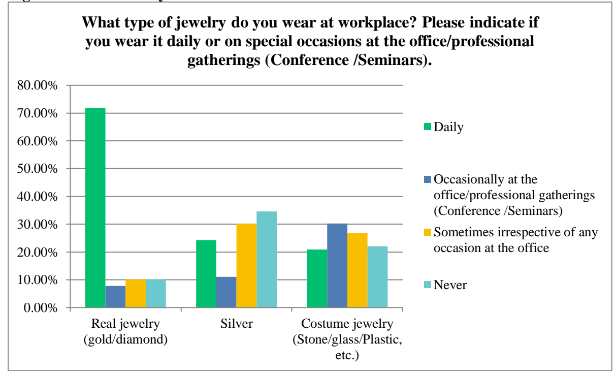
Figure no. 3: Jewellery and other accessories

It was observed that a large number of respondents preferred real jewellery 156 (72%) on daily basis. Costume jewellery was also preferred by 46(26.74%) number of respondents as it is can be easily carried with no maintenance.