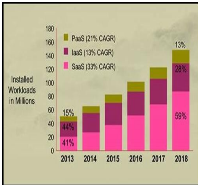
Fig: 1 Global Cloud Index [CISCO][2013-2018].[2]

Figure 1 shows that majority of workload traffic will be covered by SaaS, and Paas will be second fastest growing service.[2]