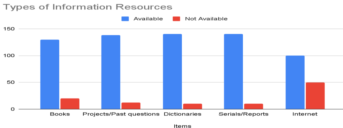
Figure 3: Types of Information Resources available at FUL Library.

The researchers investigated the availability of information resources by asking about some popular types of resources available at libraries. Figure 2 below highlights the findings from the questionnaire.