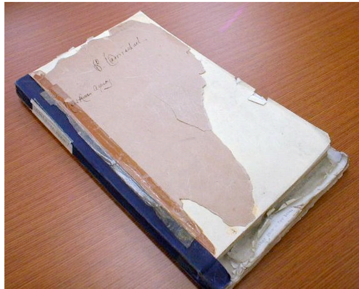
Image of original volume of testimonies.

From the McKenna McBride Commission hearings