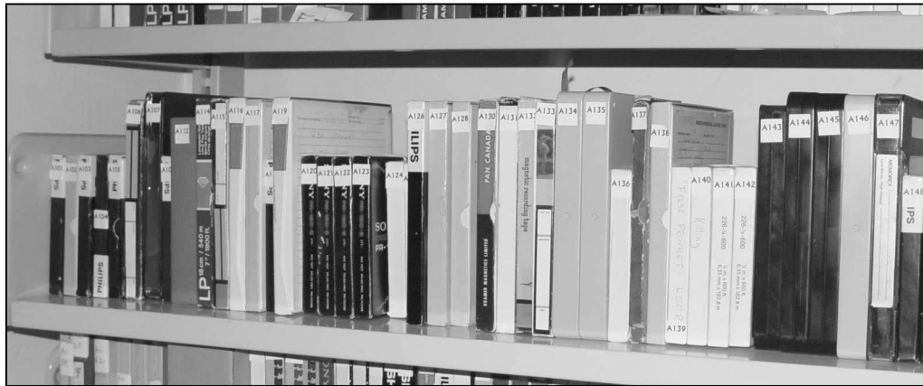
Image of audio reels in the UBCIC Resource Centre archives

Recording of meeting with Judd Buchanan, DIA, January 9/75