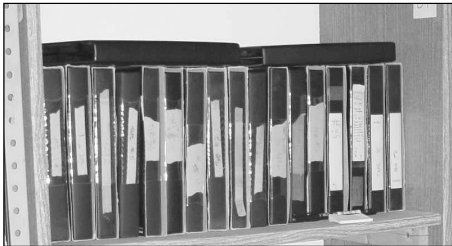
Image of Video Reels at the UBCIC Resource Centre

Video excerpt from The Land is The Culture