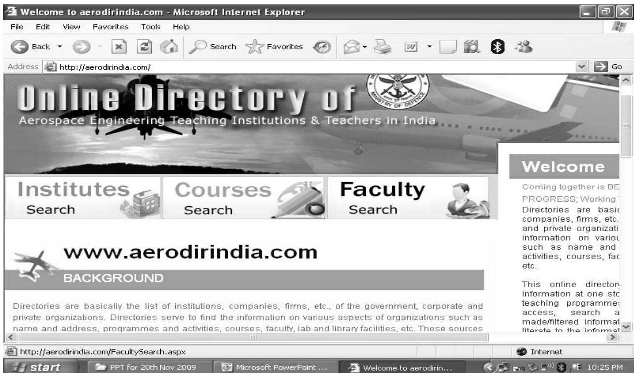
Figure 1. Screenshot of the directory.